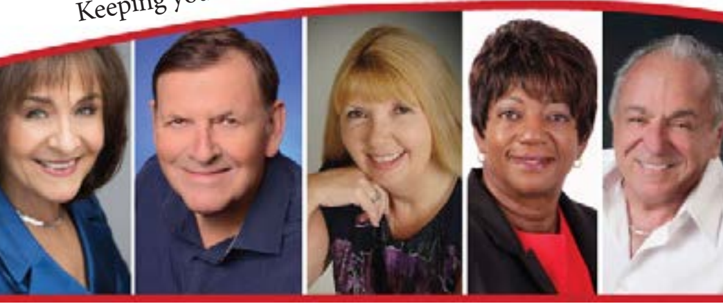
while getting assistance when and where you need it!

Keeping you at the helm of your book production . . .